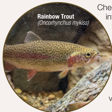
Rainbow Trout ( Oncorhynchus mykiss )

There are 20 public access sites to the Hiwassee River where you can put in or take out your paddle craft—and endless ways to plan a trip between them. Assuming three miles per hour is your average speed, you easily could enjoy short stretches of the river in an afternoon, with stops to explore islands and other natural features along the way. To make a multi-day trip, just plan to stay at one of the adjacent campgrounds or in the small towns that line the river's shores.